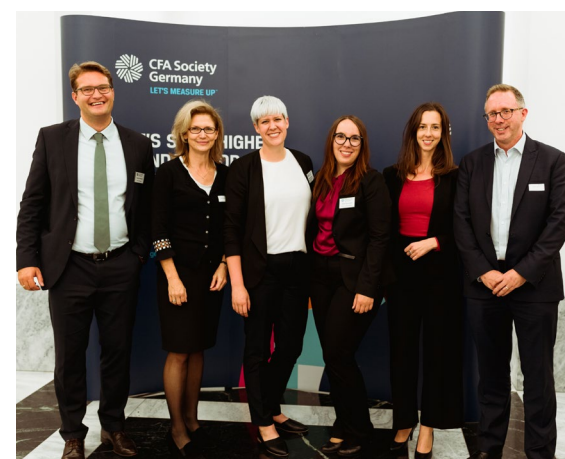
Top: Impressions of the conference

CFA Society Germany invited experts and practitioners from a wide spectrum of finance and investment to discuss